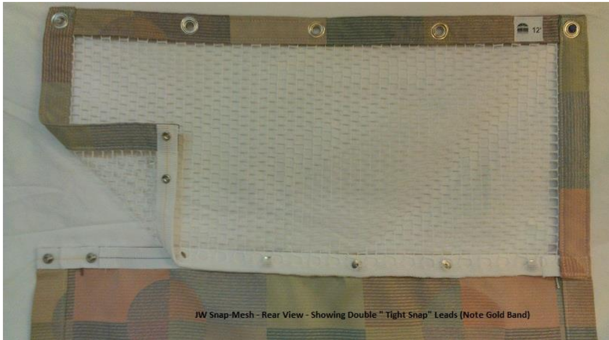
JW Snap-Mesh - Rear View - Showing Double "Tight Snap" Leads (Note Gold Band)